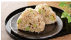
Onigiri rice balls with sticky barley, Edamame and salted kelp