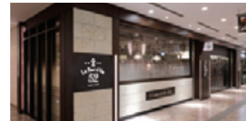
Le Bar à Vin 52, a Seijo Ishii production. With a menu of tasty items made with Seijo Ishii ingredients, Le Bar à Vin 52 wine bars serve fine foods and wines carefully selected by the parent store's expert buyers.