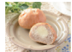
Pearl barley & walnut milky cream buns