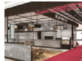
Entrance to a Seijo Ishii “grocerant”