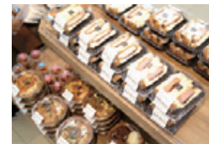
Machikado Chubo in-store kitchen delicacies