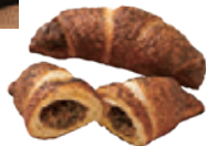
Sweet bean paste gipfeli