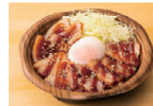
Charcoal-grilled pork rice bowl

The LAWSON SCM-CRM Model facilitates development of delicious, highly appealing products and product offerings from the customer's perspective. It uses Ponta Point Card members' personal attributes (gender, age, region of residence, etc.) to analyze their purchasing behavior, visualize expected opportunity loss (missed sales) and conduct order planning. This analysis also contributes to food waste reduction. CRM activities provide the driving force for increasing sales and profitability by helping us to understand our communities, stores and customers better.