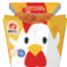
Kara-age Kun Regular