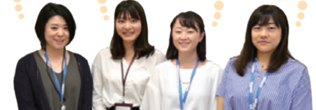
Tohoku Merchandising Dept.

I envision a bakery section that always provides customer satisfaction.