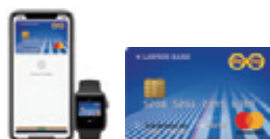
The LAWSON Ponta Plus credit card system

In another new development, customers earn added Ponta points when they use the Lawson Ponta Plus credit card introduced in January 2019 to make purchases at LAWSON stores.