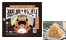
Akuma-no ("devilishly delicious") onigiri rice balls