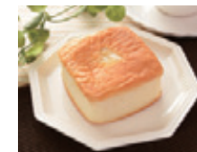
Double-cream square buns